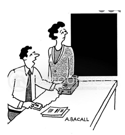
"I have a plan 'B', but that's also dependent on a working projector bulb."

There are some more changes coming to a sanctuary near you. If there are no supply chain shortages that seem to be so prevalent today, there are some modifications coming to the sanctuary. As you have probably noticed, the left projector is missing; its been dispatched to recycle