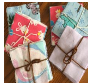
4 inch cloth squares in bundles

The next White Cross get-together will be on January 10 at 9:30 in the church's lower level. All are welcome. For more information please contact Marcy at 597-987-2004 or hufnagelmm@gmail.com