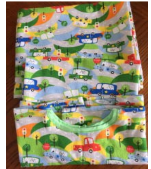
Baby layette with jacket, diaper and blanket