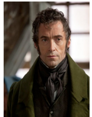
Jean Valjean is protagonist of Victor Hugo's 1862 novel Les Misérables. The story depicts the character's struggle to lead a normal life and redeem himself after serving a 19-year-long prison sentence for stealing bread to feed his sister's starving children and attempting to escape from prison.