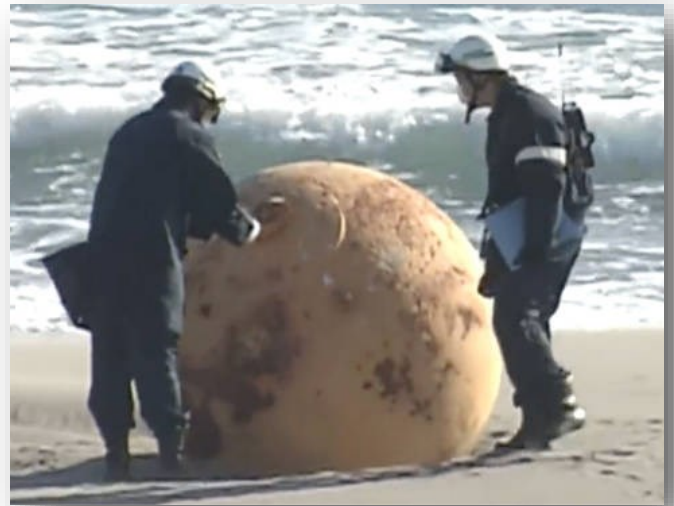
Mystery "Beach Ball" Appears in Japan