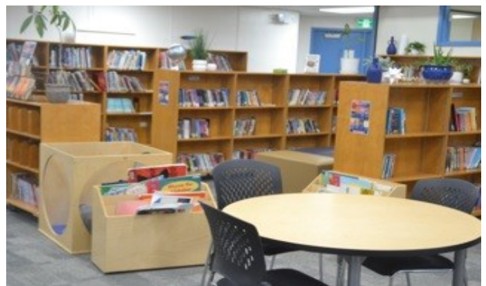
The library at Hillview School