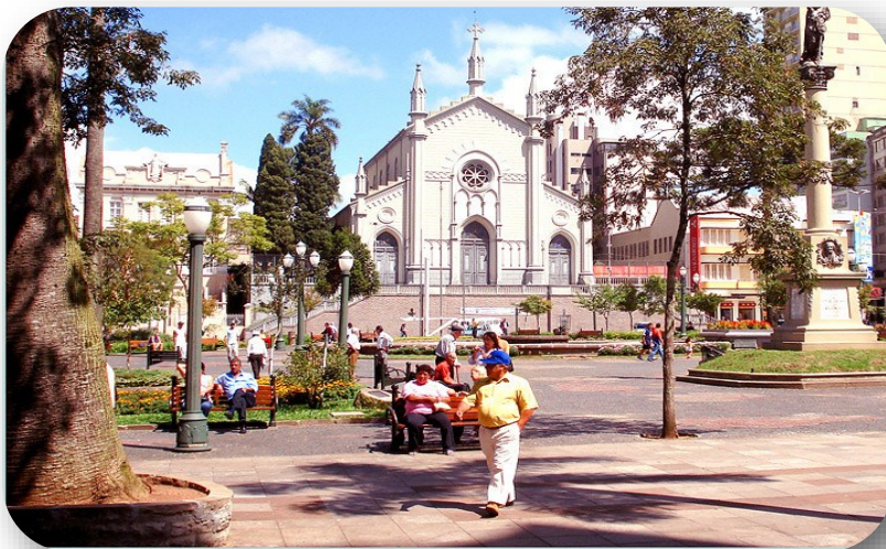
The Diocese of Caxias do Sol