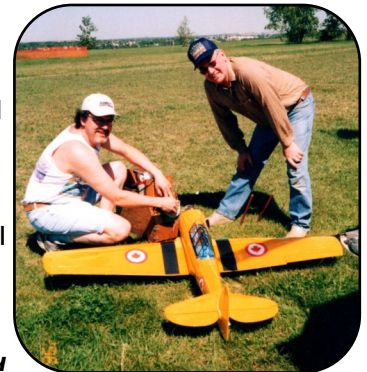
Son Dan, Sieg and unknown aircraft

Hillview people - Do you know someone that has a hobby, a passion or activity? I would love to include their story in the November issue. I have run out of possible candidates, so it is up to you. I will assist you, with questions and do the final editing, just let me know of someone. Story deadline - October 20.