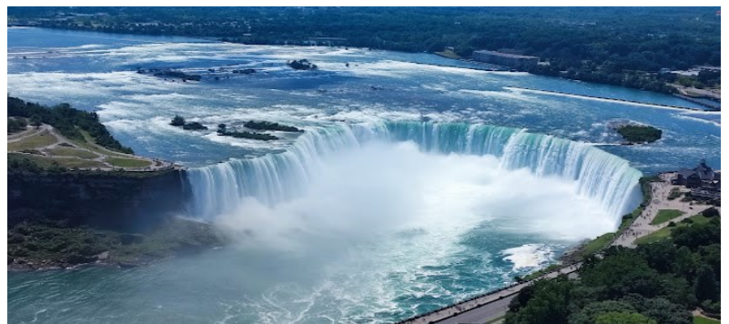
Niagara (Horseshoe) Falls