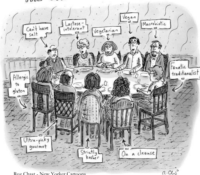
Roz Chast - New Yorker Cartoons

Oct. 9: Thanksgiving Sunday - no coffee time. Plan to surprise someone and invite them for lunch. Just warn them that it is liver and onions.