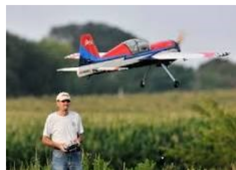
This is not Seig!

or friends that have an interesting hobby or activity. Next month, I am hoping to include an item about Seig Hollemeyer and his passion - building and flying model airplanes.