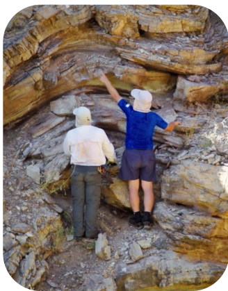
examining the "fold" or "bend" in the rock formation

The Grand Canyon provides the opportunity to find this proof and a perfect excuse for two middle aged men to take a rafting trip. Their major focus is the "folding" of various rock layers that can easily be accessed within the can-