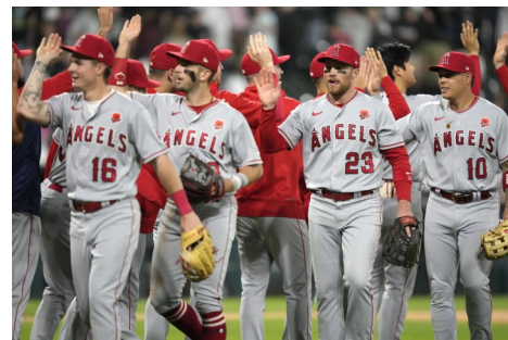
Not these angels, they are only a baseball team.

"God is often described as speaking in silence—in the depths of conscience, intuition, and reflection."