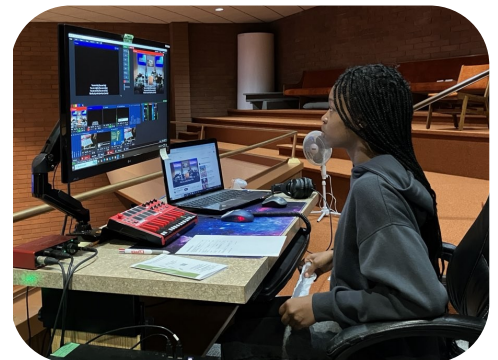
Emerald at the Hillview's livestream station.

7. What are you doing in September? Are you excited about the challenge?